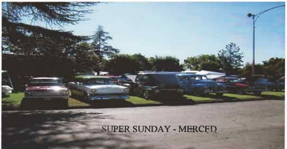
SUPER SUNDAY - MERCED