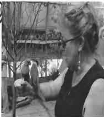
Feeding the birds at Micki Grove Park Zoo