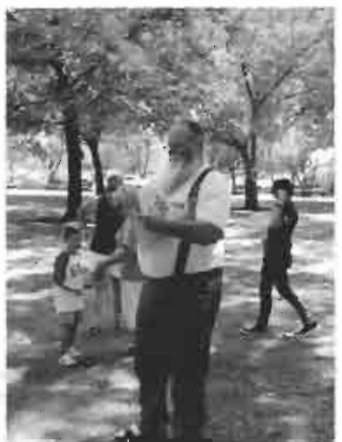
Club Summer Picnic